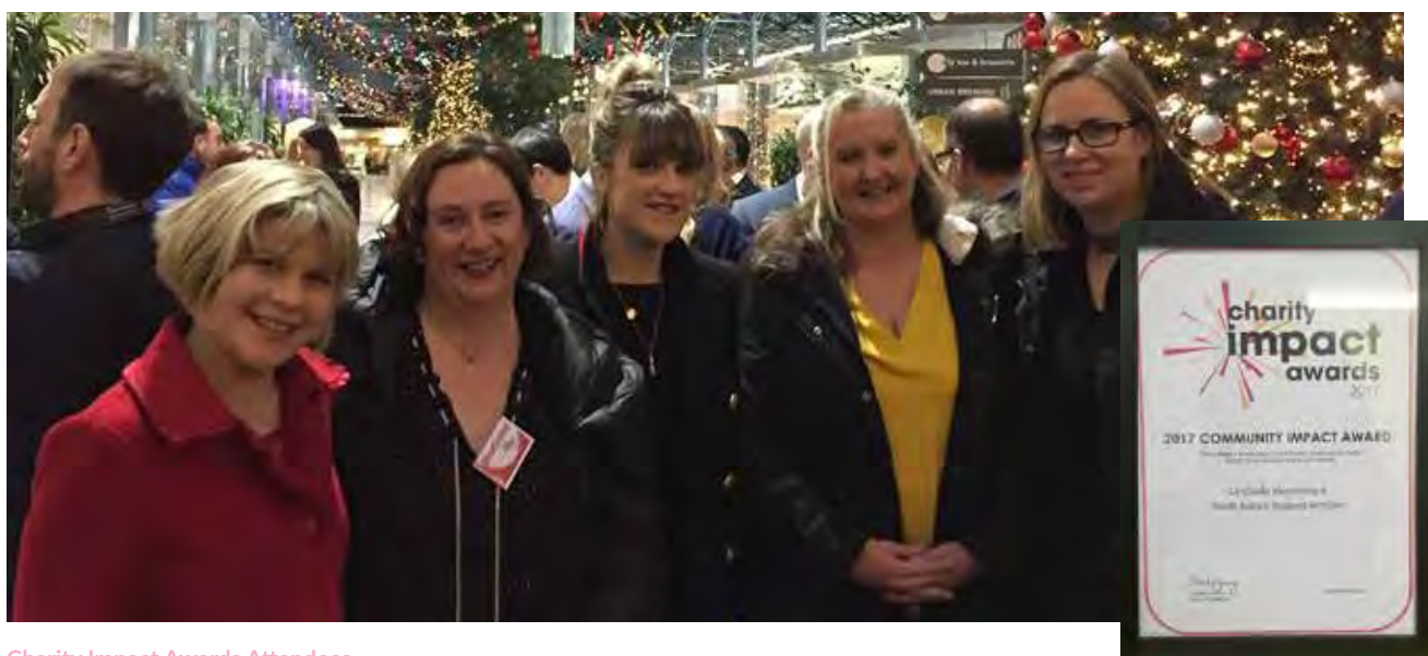
Charity Impact Awards Attendees

Ultimately it wasn't to be Le Chéile's night with Barnardos taking home the award but the organisation received a lot of welcome support and good wishes along the way from staff, volunteers, colleagues in our partner agencies across the country and extended friends and family.