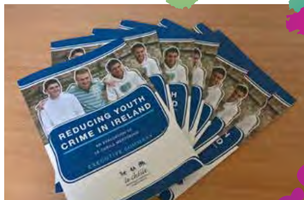
Copies of the Evaluation