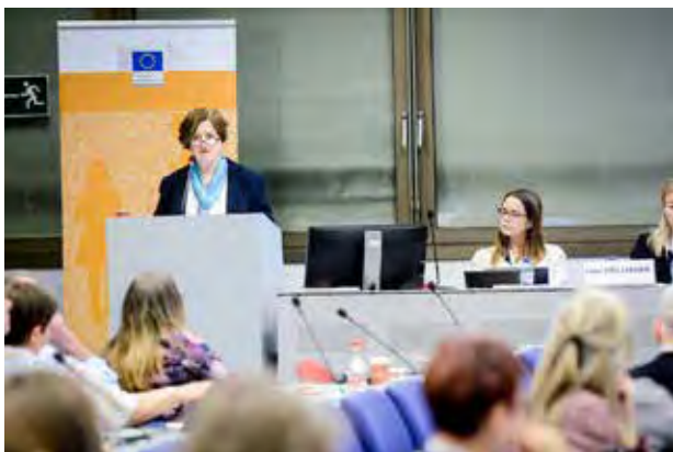
European Forum on the rights of the child