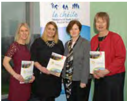
10 years of Strengthening Families