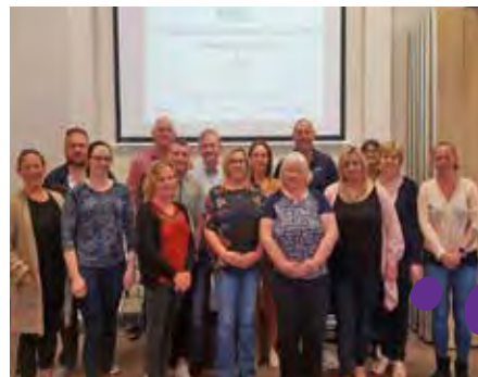
Listowel Strengthening Families Facilitator Training