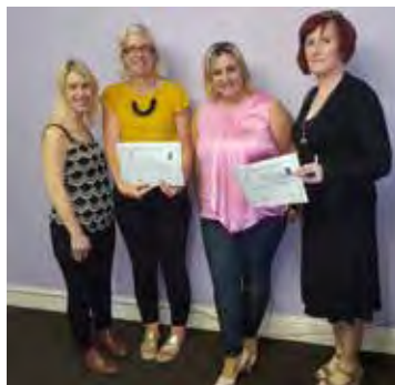
Cork Strengthening Families Coordinator Training